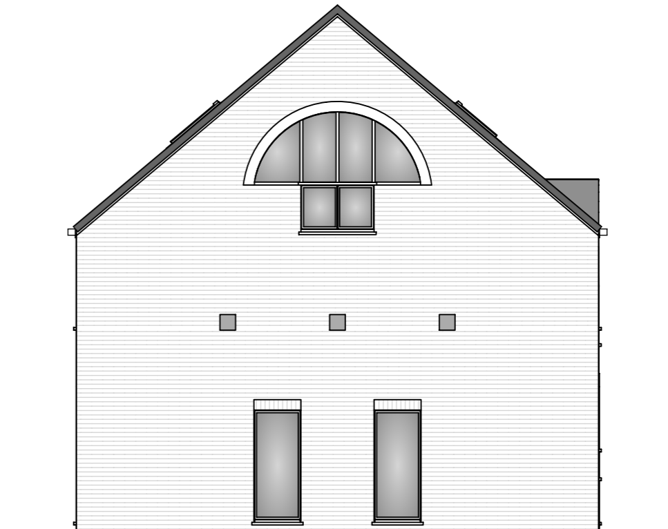
FACADE DE GAUCHE